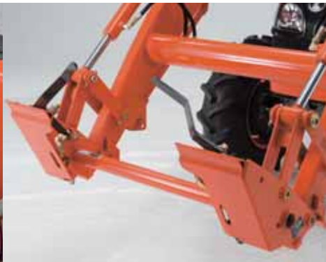
2-lever Quick Coupler